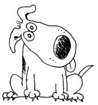
Volume 1, Issue 2 August 2008